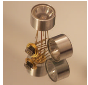
Package TO-5 with Parabolic Reflector

• Related products: PD36-03-TEC-PR can be used in optical pair with our LED27÷LED36 and LD300÷LD360 . We offer the preamplifier model AM-04 suitable for PD36-03